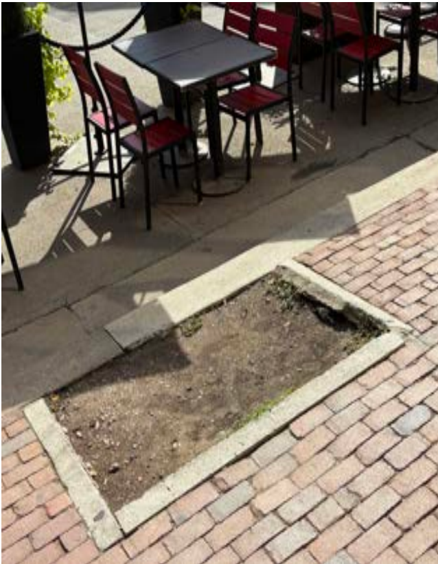
Unit Block of Union Street