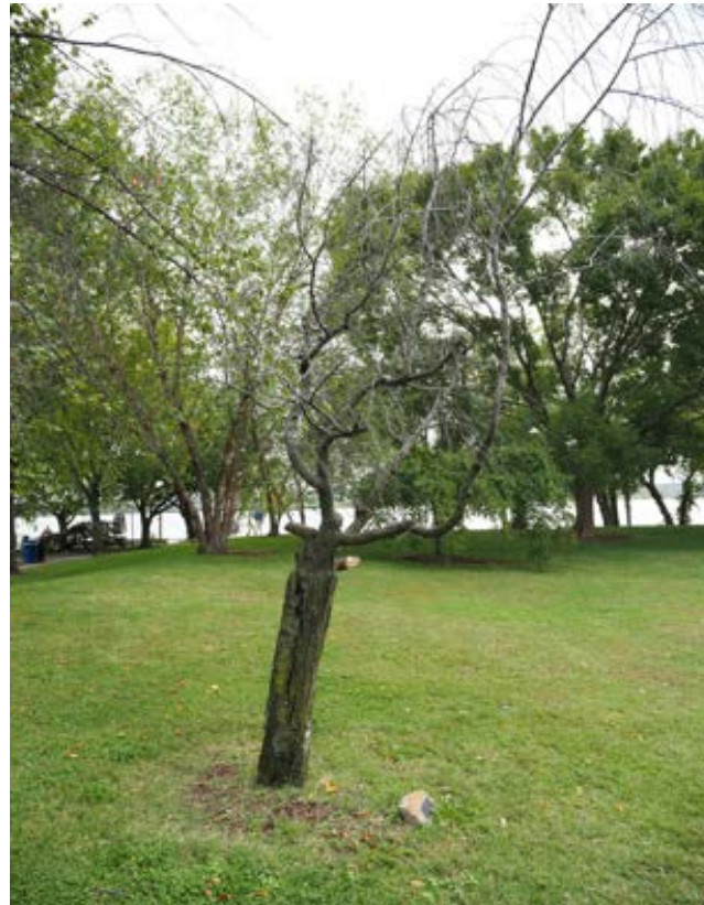
Dead Tree in Founders Park