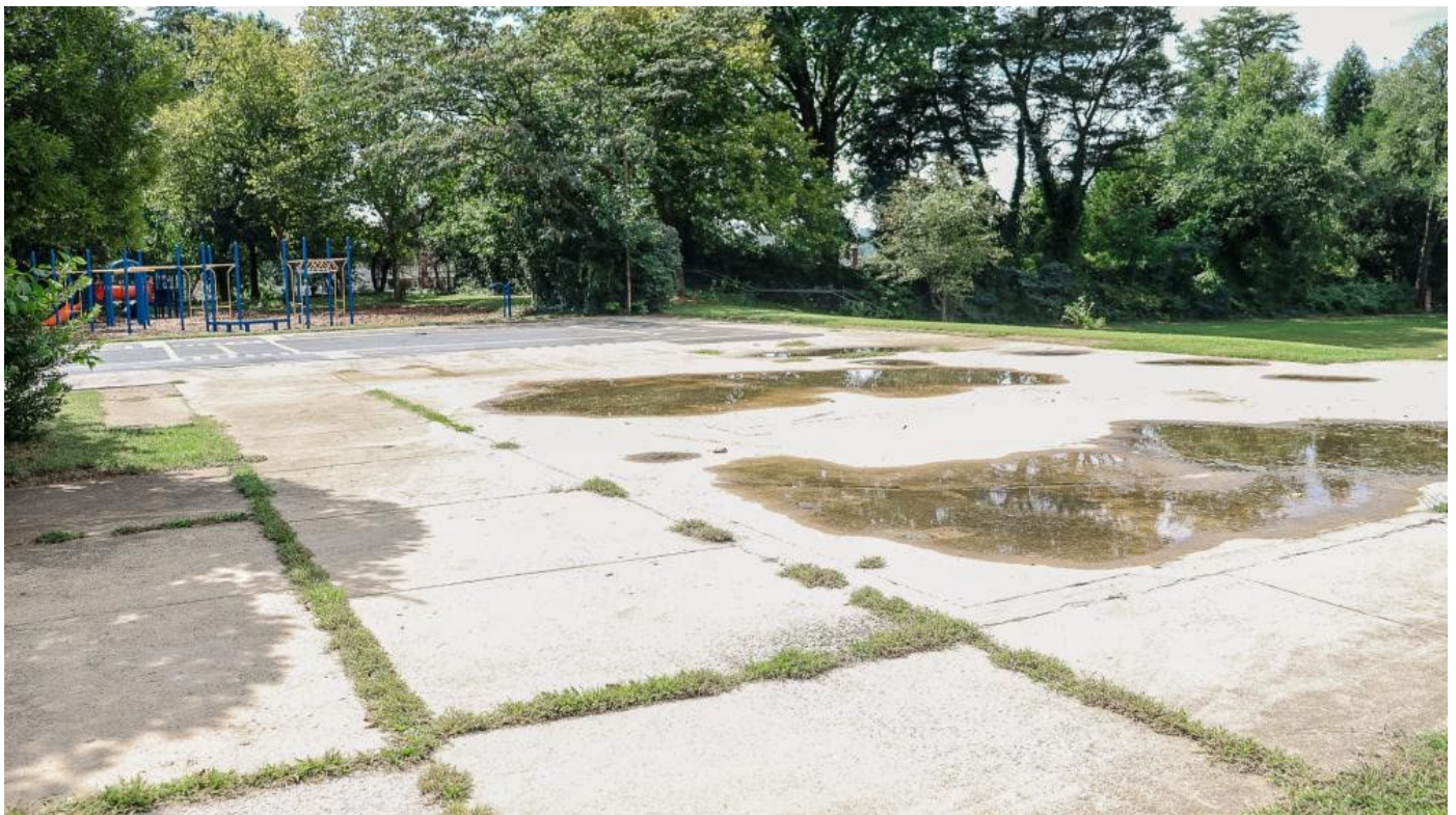
Existing paving conditions