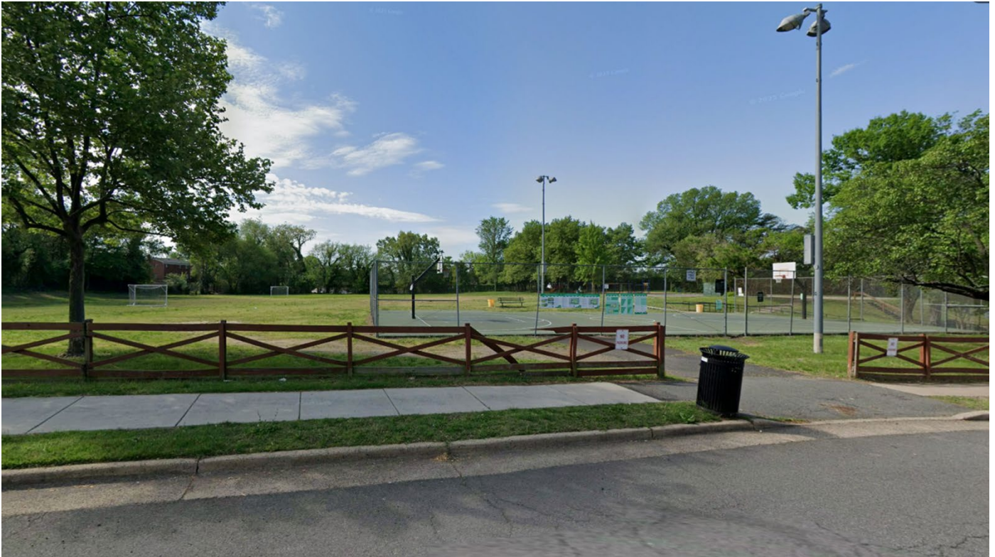
Appearance of the park from Duke Street