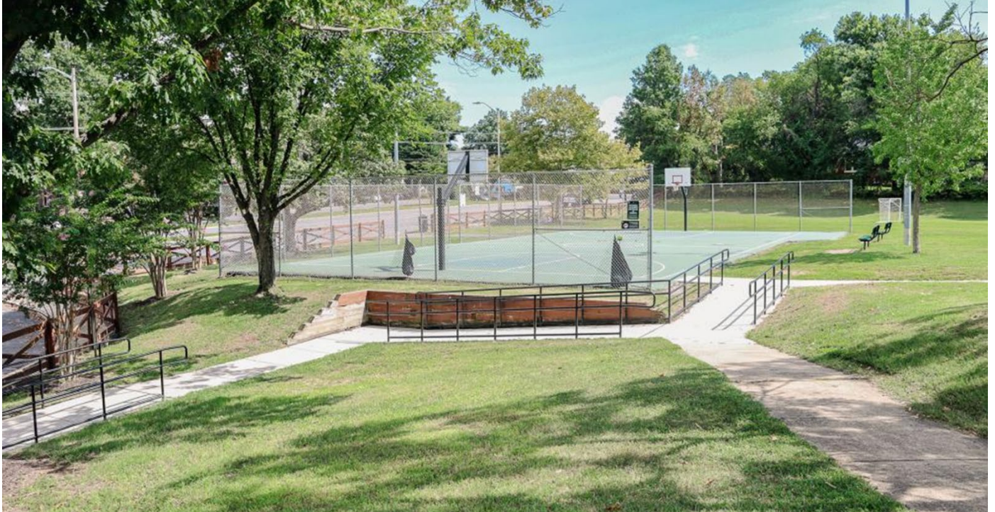
Image of basketball court