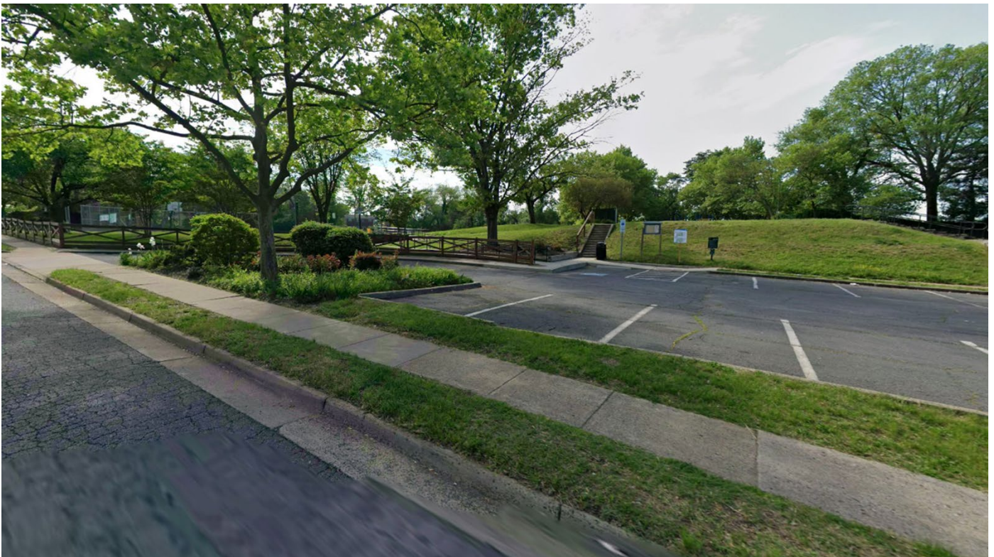
Appearance of the park from Duke Street