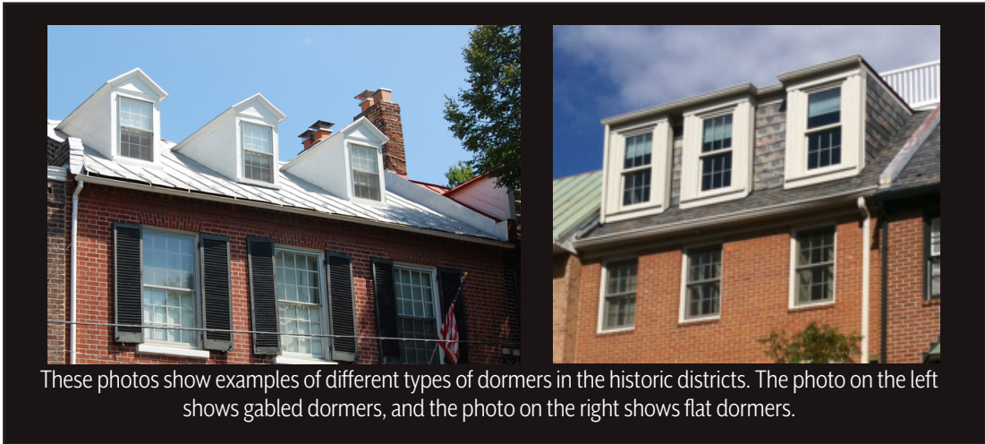
These photos show examples of different types of dormers in the historic districts. The photo on the left shows gabled dormers, and the photo on the right shows flat dormers.

Dormers are windows projecting from the slope of the roof that provide light and ventilation to the top floor of a building. Dormers are particularly visible elements of a roof and can have adverse impacts on a building If not properly designed and sited. If an unacceptable loss of existing historic fabric will result because of the installation of dormers, such installation is not appropriate.