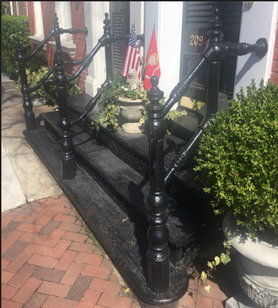
Example of historically appropriate cast iron steps and handrail on an Italianate-style residence.