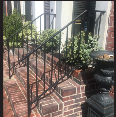
Example of inappropriate modern brick stoop and iron handrail on an Italianate-style residence.