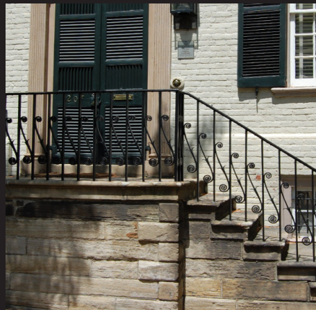
Example of historically appropriate stone steps, iron handrail and guardrail on a Georgian-style residence.