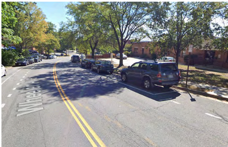
Eastbound gap forces people biking to share the road to retain 8 street parking spaces