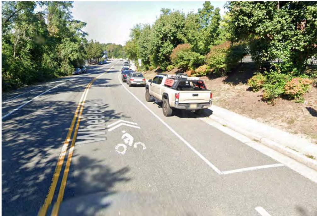
Westbound gap forces people biking to share the road to retain 10 street parking spaces