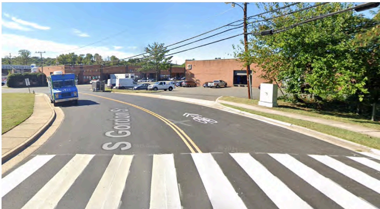
Gordon St gap forces people biking to share the road to retain 5 street parking spaces