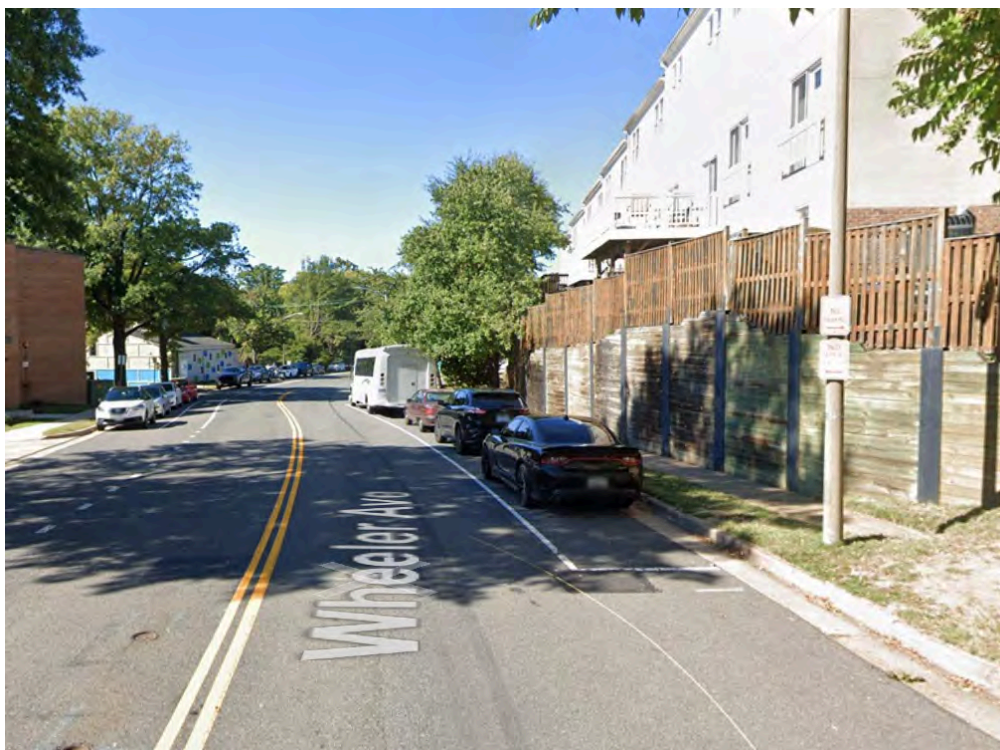
Westbound gap forces people biking to share the road to retain 8 street parking spaces