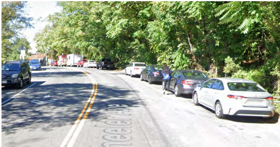
Westbound gap forces people biking to share the road to retain 19 street parking spaces