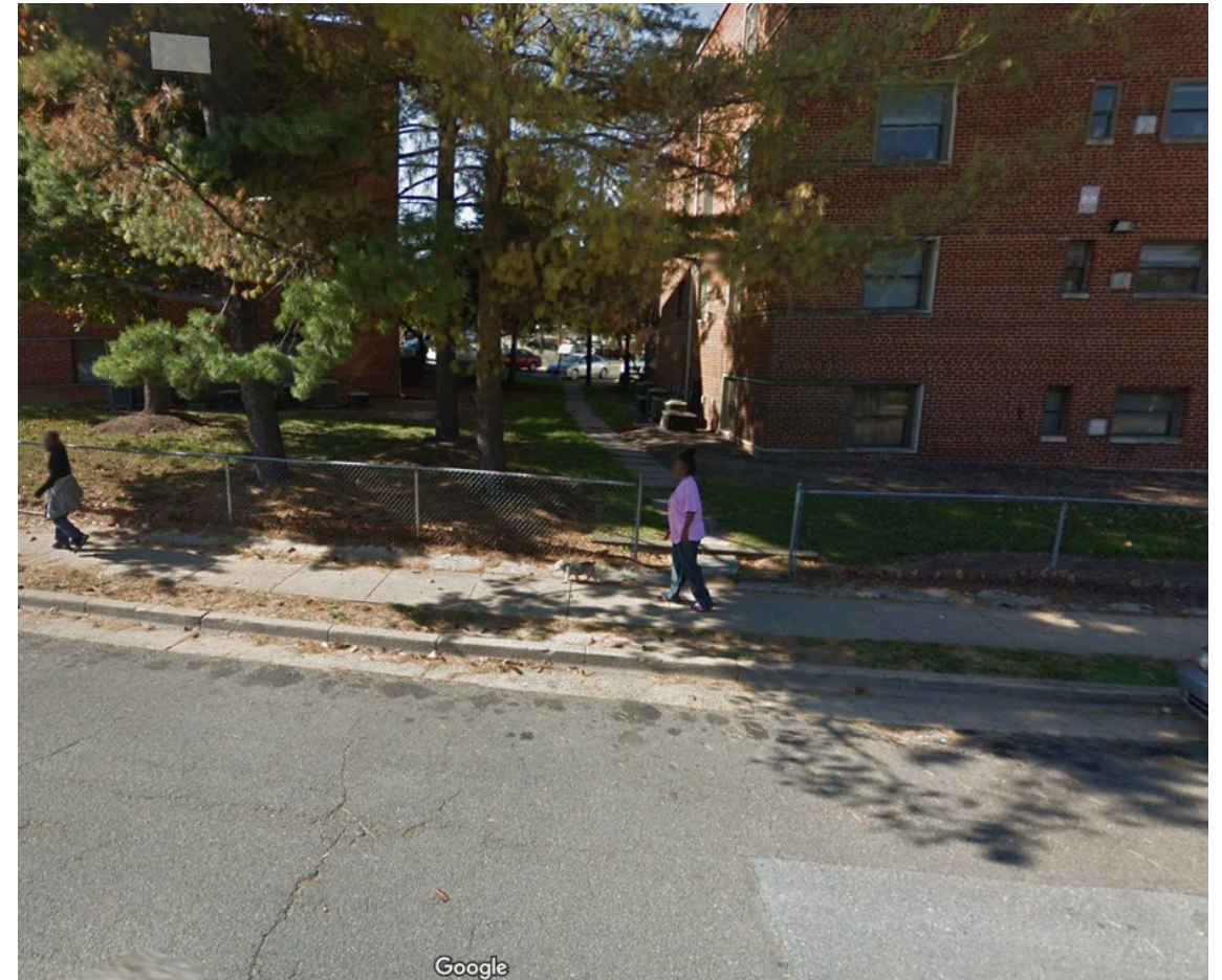
Path between apartment buildings