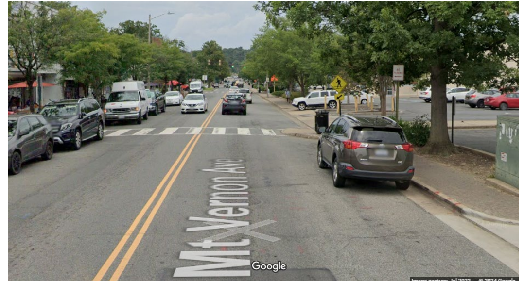
Street View of the 3800 block of Mount Vernon Avenue (looking north from 3807)