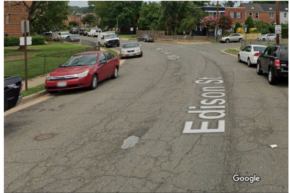
View driving north on Edison Street