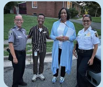
AIPA staff visited with community members and APD officers during one of the 2024 community cookouts in Alexandria