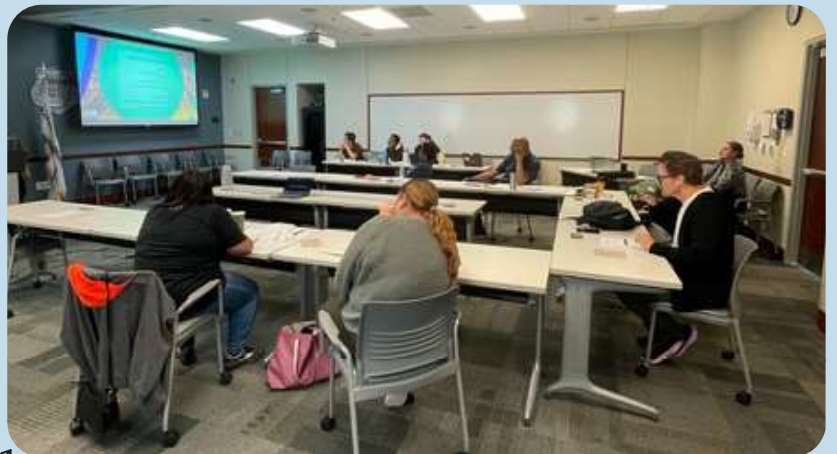
ICPRB members listened attentively during the APD presentations by various APD staff during the 9/28/24 training.