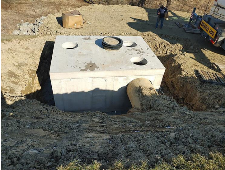
New storm sewer and inlets on Mt. Vernon Avenue & Alley