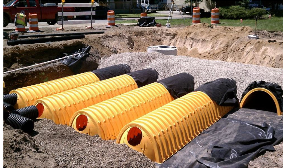
Underground storage tanks in the alley and cul-de-sac