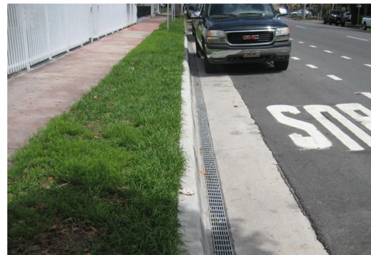
Trench drains along the curb line