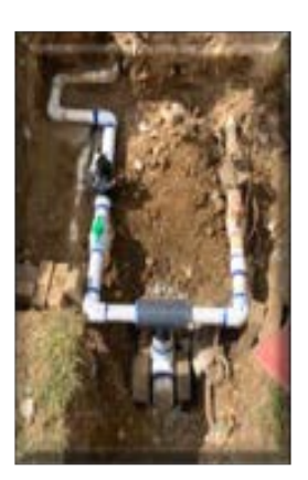
Robinson Landing Staff Booth Project Manager: Park Maintenance & Park Support Staff

A new staff booth at the Robinson Landing Pier was installed to manage transient boating activities. The transient piers were built for the City through private development.