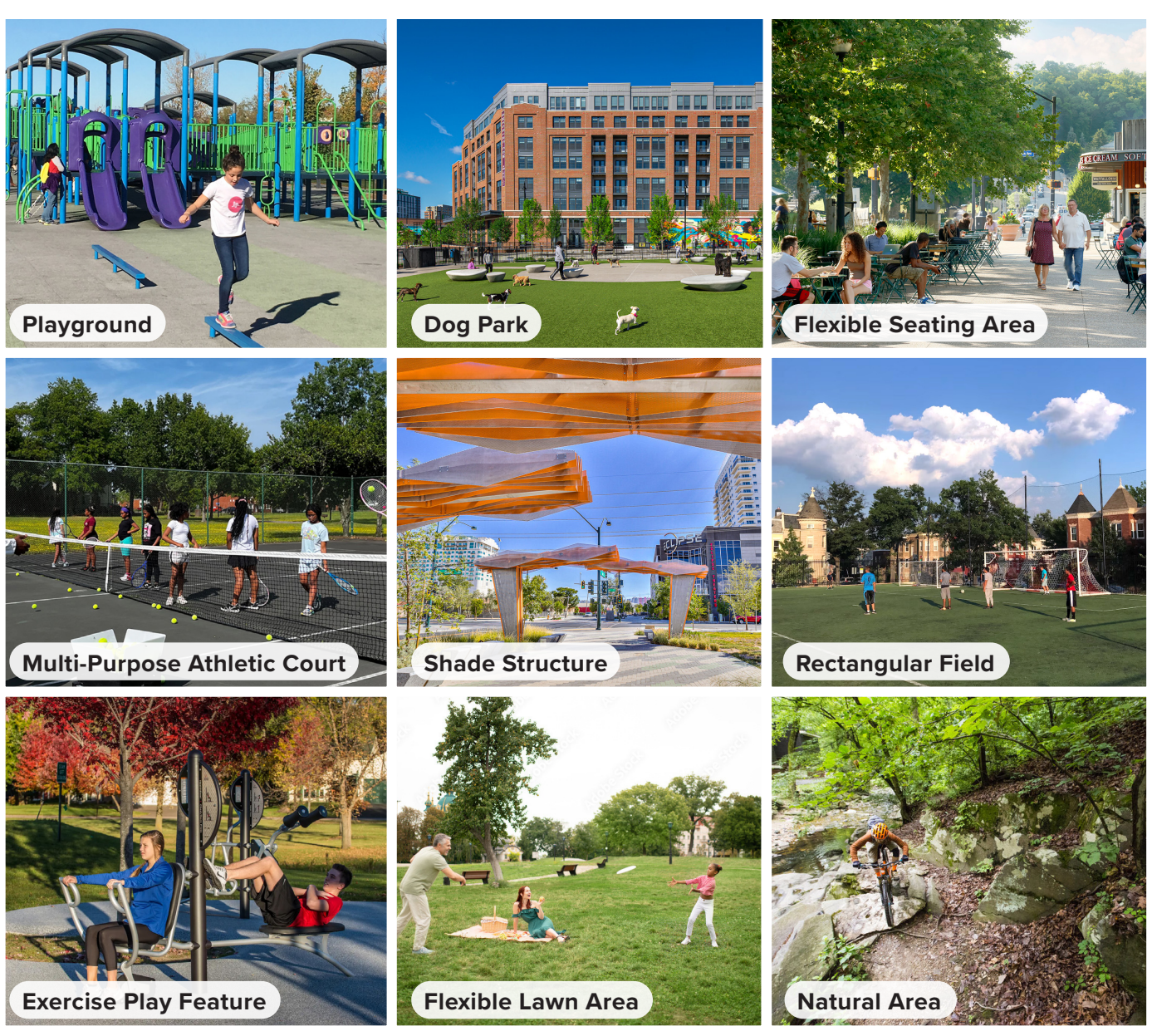
June 25, 2024 | DRAFT AlexWest Small Area Plan | Fact Sheet | 2

New park amenities are intended to serve people of all ages and abilities.