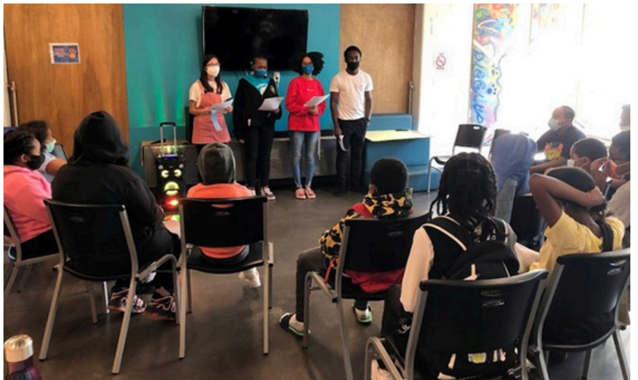
Four of the Keep It 360 Peer Advocates present a workshop to their peers