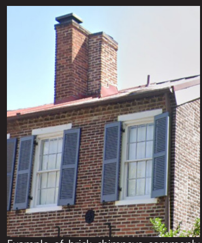
Example of brick chimneys commonly found on historic Old Town residences.