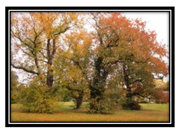
Old-age Black Cherry Grove at Penny Hill Cemetery