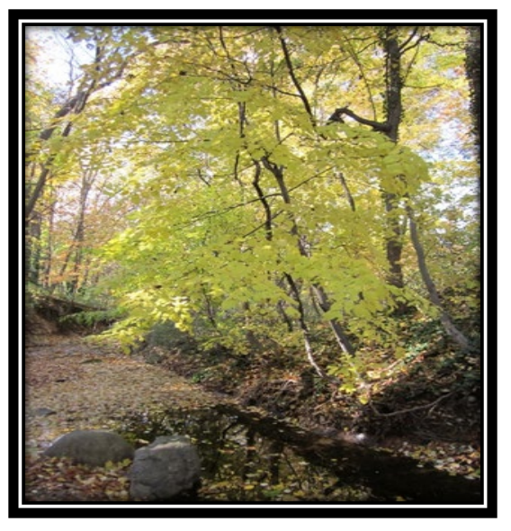
Basswood and ancient, ice-rafted cobbles along Timber Branch Cemetery