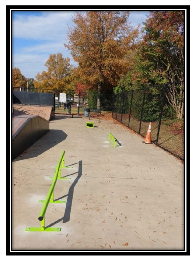
Schuyler Hamilton Jones Skateboard Park New grind rail installation