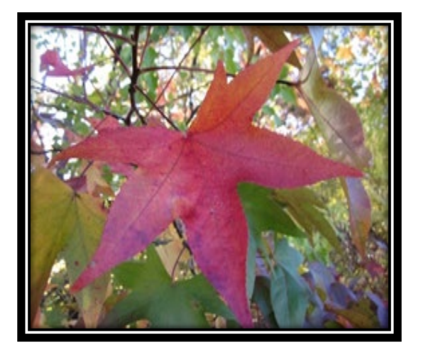
Sweetgum Fall Color