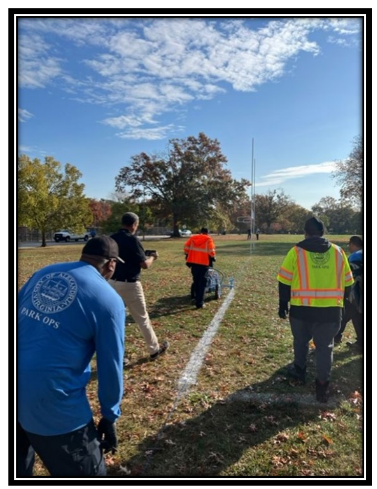
Chinquapin Field Paint Sprayer training for staff