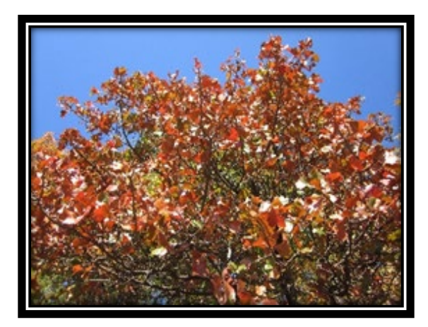
Blackjack Oak Fall Color