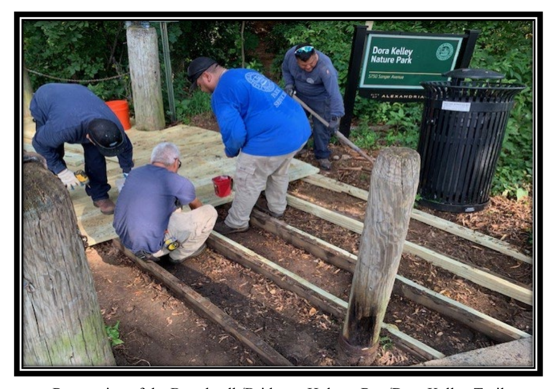
Restoration of the Boardwalk/Bridge at Holmes Run/Dora Kelley Trail