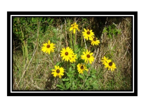
Black-eyed Susan in bloom at the Telegraph and Duke Meadow Complex