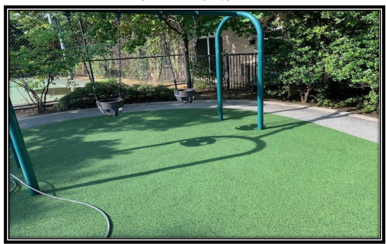
Playground After Power Washing