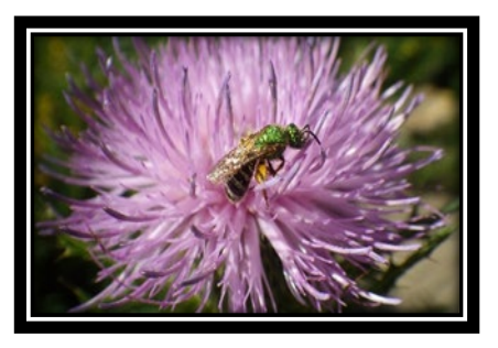
Field Thistle at Tarleton