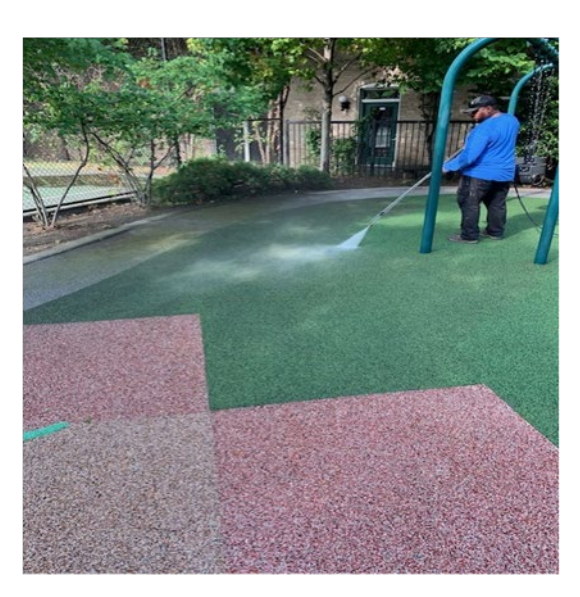
Cleaning/Power Washing Playgrounds