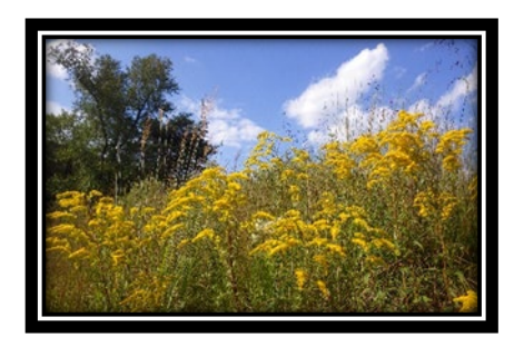
Early Goldenrod in bloom at the Hammond School Meadow