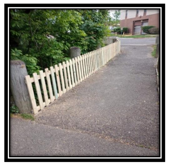
Holmes Run fence replace by staff Holmes Run Park