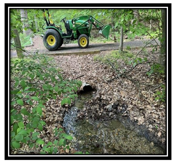
Park staff removed logs, leaves, and debris to clear storm drain. Dora Kelly Park