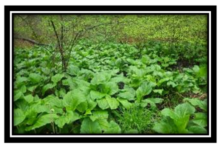
Globally rare Acidic Seepage Swamp at Chinquapin Park