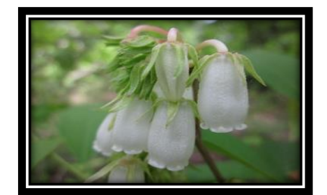
Staggerbush at Forest Park