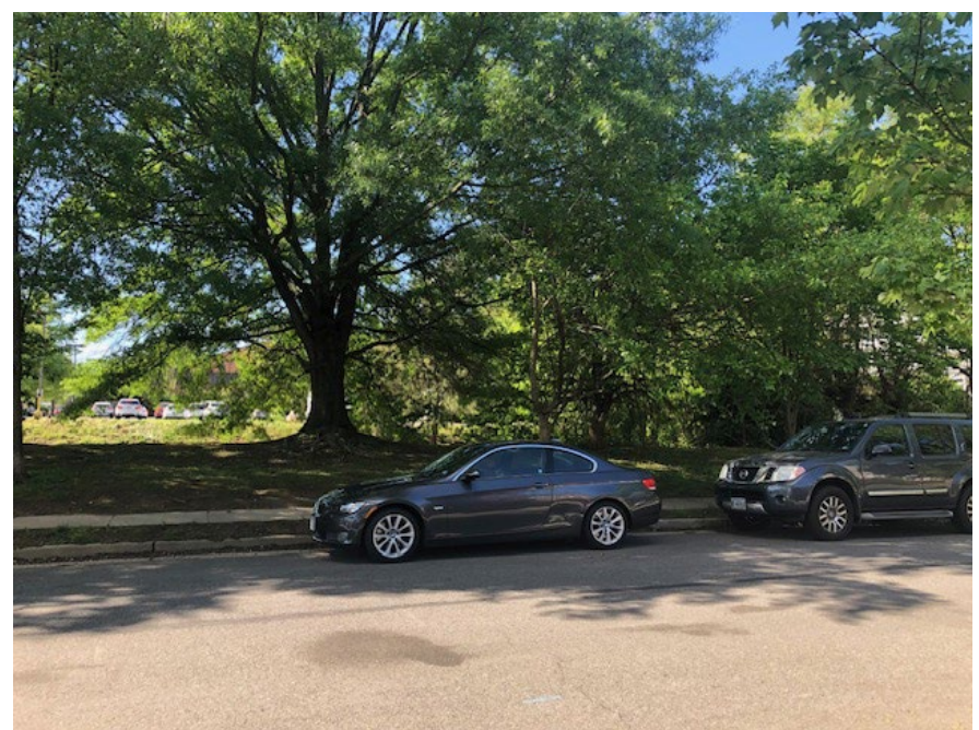
Here you can see the YMCA in the distance. The honey locusts are on the right behind the SUV.