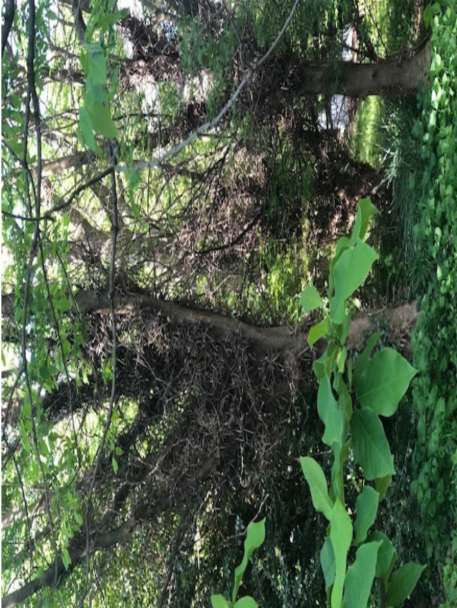
Close up of several honey locusts at that location