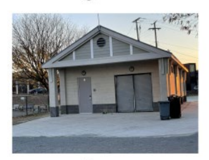
A1 CONTEXT IMAGE