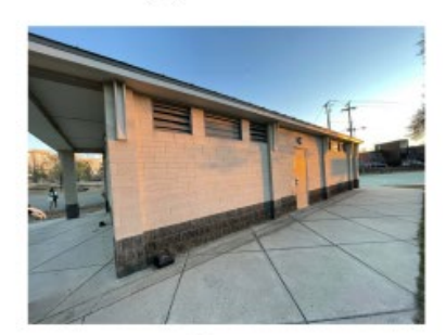
A4 CONTEXT IMAGE