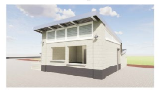
B1 CONCESSIONS VISUALIZATION