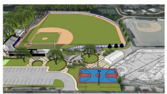
Site Improvements (View North)