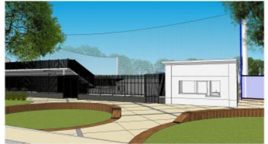
Seating / Rear Bleacher Screening -