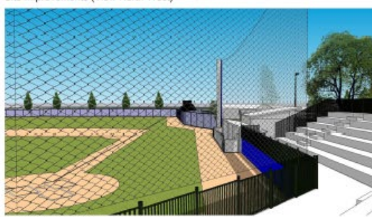
Big Simpson Bleacher-