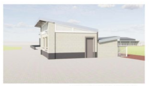
C4 CONCESSIONS VISUALIZATION