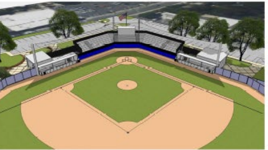
Site Improvements (View South-West)