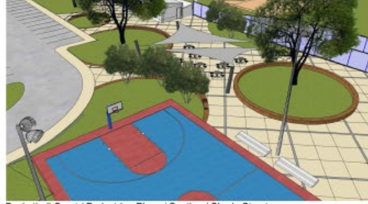
Basketball Court / Pedestrian Plaza / Seating / Shade Structure -