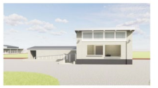
C1 CONCESSIONS VISUALIZATION