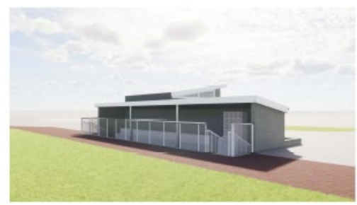
B4 DUGOUT VISUALIZATION