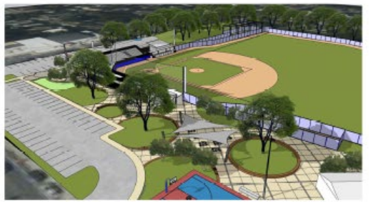
Site Improvements (View North-West) -