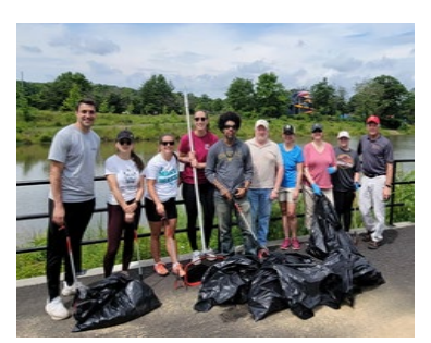
Lake Cook clean-up.

Board monthly meetings for both Holmes Run Gardens and Chinquapin Community Gardens have been held for the 2022 season beginning in March, with staff attending. The driveway area at Chinquapin Garden has been scheduled for repair work through Park Planning and will be done June 13. All gardens are rented at Holmes Run,