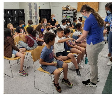
Students from James K. Polk meeting a box turtle during their Life Cycles program.