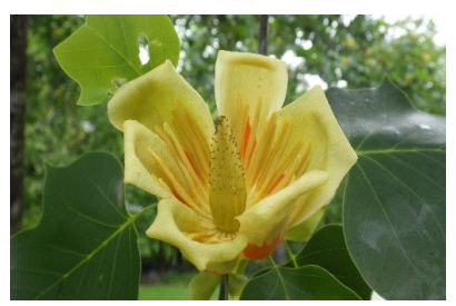
Tulip Tree flower.