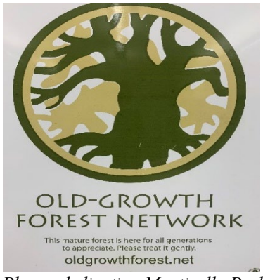
Plaque dedicating Monticello Park as an Old-growth Forest Network Community Forest site.