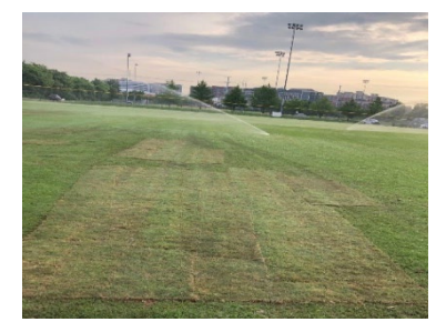
Frank Mann Field after sod repair.