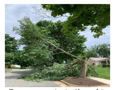
Tree emergencies in Alexandria during the month of May.