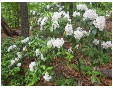
Mountain Laurel in bloom.