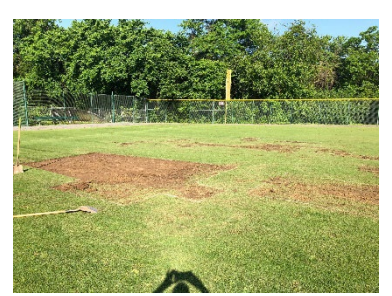
Frank Mann Field before sod repair.