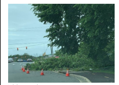
Additional tree emergencies in May.