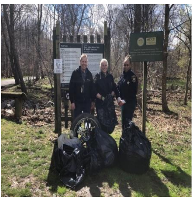
Alexandria Sherriff's office DKNP volunteers stream banks trash removed.

• The 2022 City Nature Challenge took place April 29-May 2. In this 4-day bioblitz citizens used iNaturalist to observe and document plant and animal species in the City of Alexandria. Current counts show 851 logged observations of 434 individual species by 50 observers. Final results, will be available in early-May.