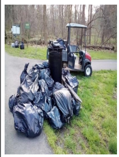
Trash was removed from the stream banks in DKNP. Volunteers included the Alexandria Sherriff's office.