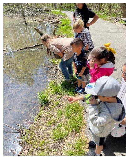
Students participating in OSTP at William Ramsay got a closeup look at one of our snakes.