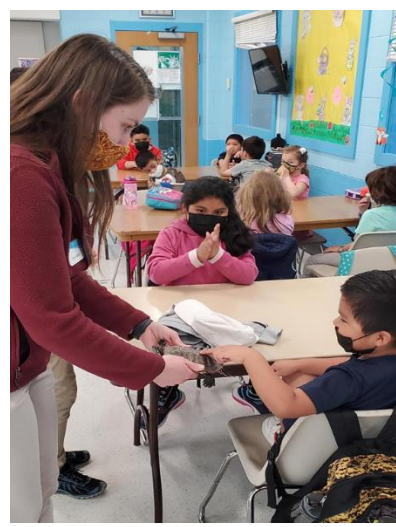
Our Little Adventures group took a walk to the pond in DNKP and spotted several frogs, turtles, and a friendly pair of ducks.