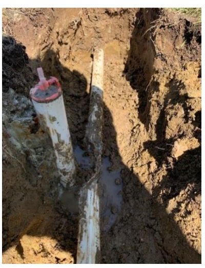
Irrigation damage at Founders Park.