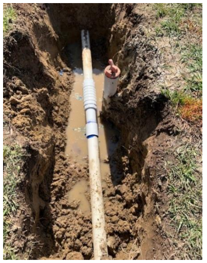
Irrigation repair at Founders Park.