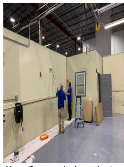
New office space in the mechanic shop at 2900BCD.