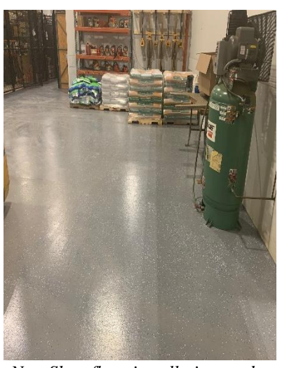
New Shop floor installation, and supply organization.