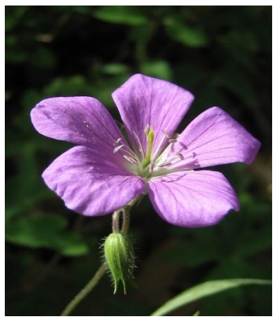
Wild Geranium in bloom at Monticello Park.