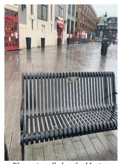
Plaque installed at the Marina.