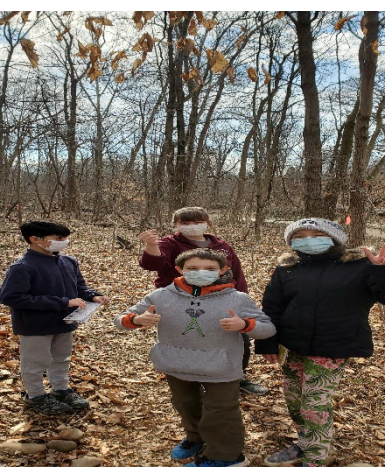
Tracks and Traces – During their search for signs of wildlife the group found a few feathers.