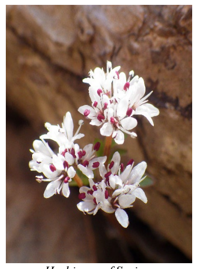
Harbinger of Spring.