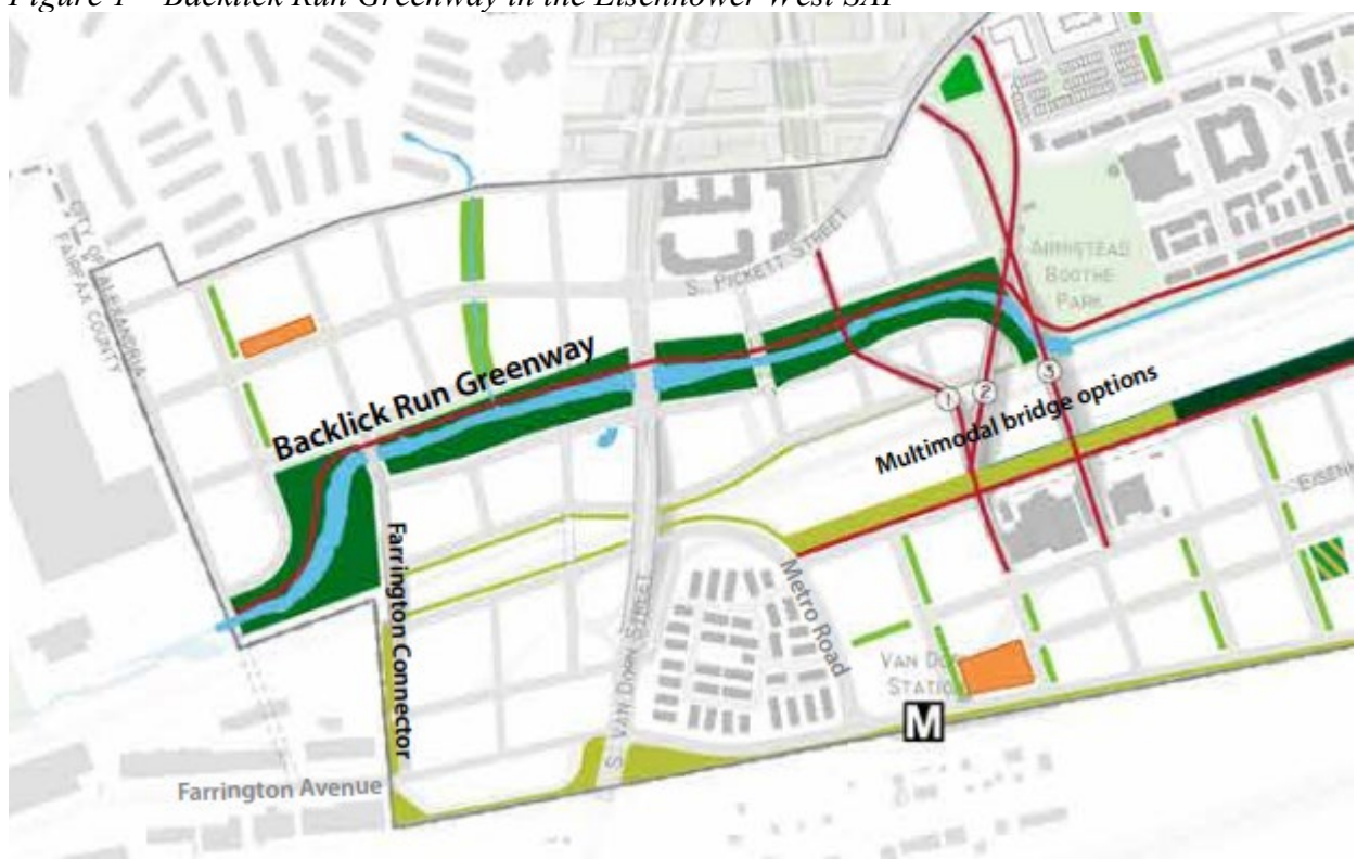
Figure 1 – Backlick Run Greenway in the Eisenhower West SAP

Staff supports the general design of the park with one significant addition. We recommend including a bridge spanning Backlick Run for pedestrians, cyclists, and emergency responders. This bridge would connect both sides of Backlick Run and provide a more hospitable route for pedestrians, cyclists, and bus riders to access the park. In addition, the bridge would further a principle of the SAP to link and expand the pedestrian, bicycle, and trail system in Eisenhower West. With this change, we believe that the park design would satisfy the SAP and provide an important open space for residents of the immediate neighborhood and wider Eisenhower West community. Staff recommends close coordination with the design team during the Final Site Plan process and construction to ensure that all elements are designed and implemented to ensure the long-term success of the park and restoration of the RPA.