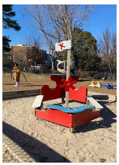
Windmill Hill playground.