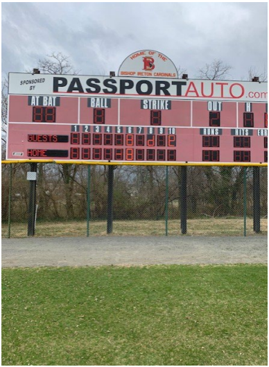
Frank Mann scoreboard.