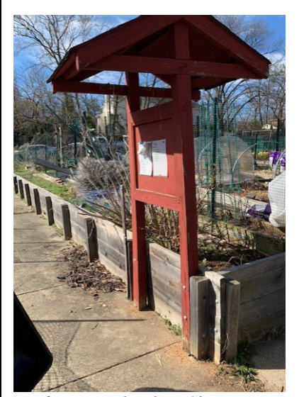
Information kiosk at Chinquapin Gardens.