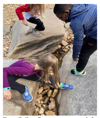
Frog Calls – Participants search for frogs and other amphibians in DKNP