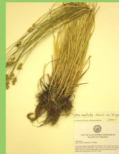
Specimens of invasive exotic plants to aid identification.