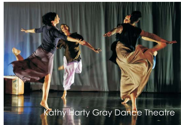
Kathy Harty Gray Dance Theatre

City Investment = $10,500 WMPA Matched Revenue = $76,366