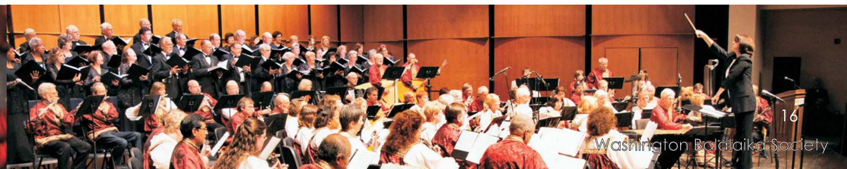
Washington Balalaika Society