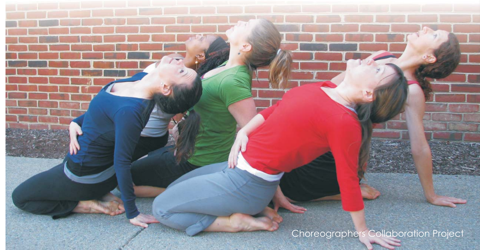
Choreographers Collaboration Project

The arts in Alexandria define and shape our community, celebrate our unique history, create a sense of place, engage and inspire the public, enrich lives, offer lifelong learning opportunities, and are valued as an essential element of our diverse community and its economy.