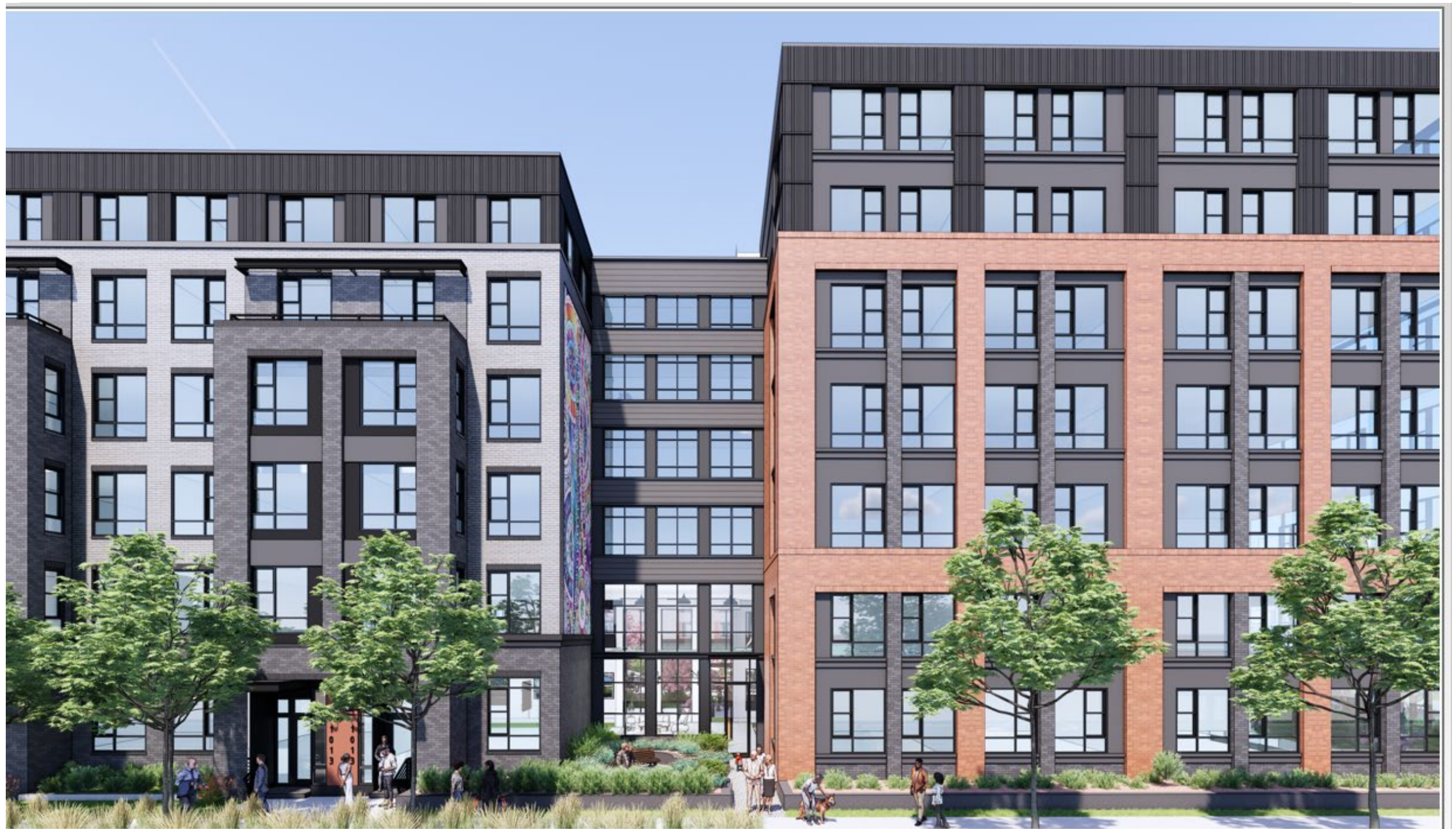
The Pedestrian Experience N. Fairfax