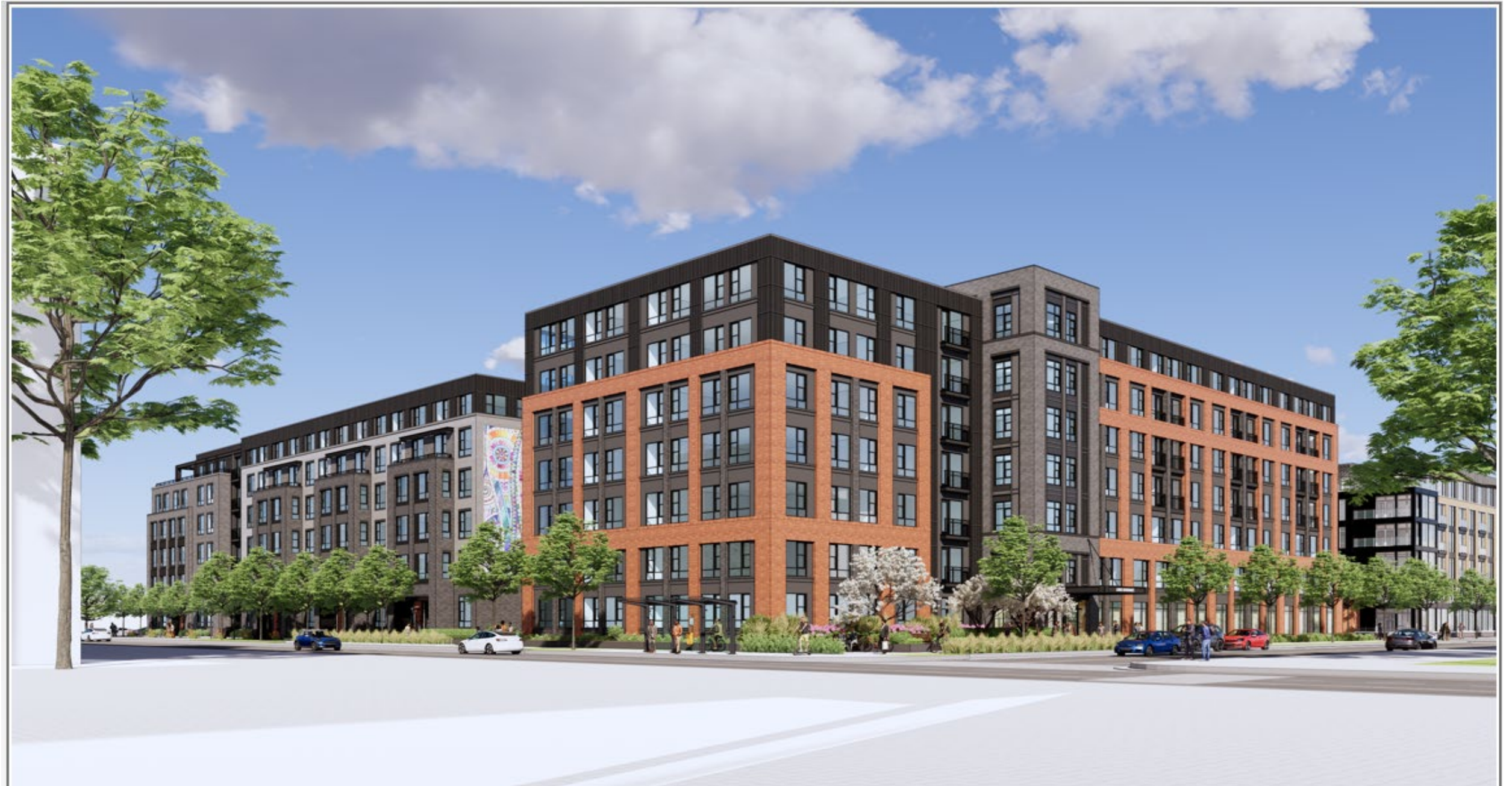
Wythe Street Facade