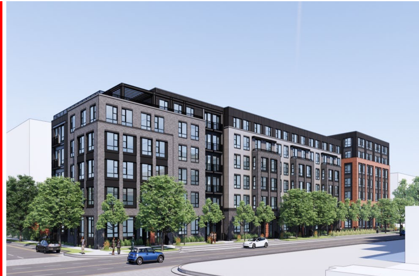
Fairfax Street Facade