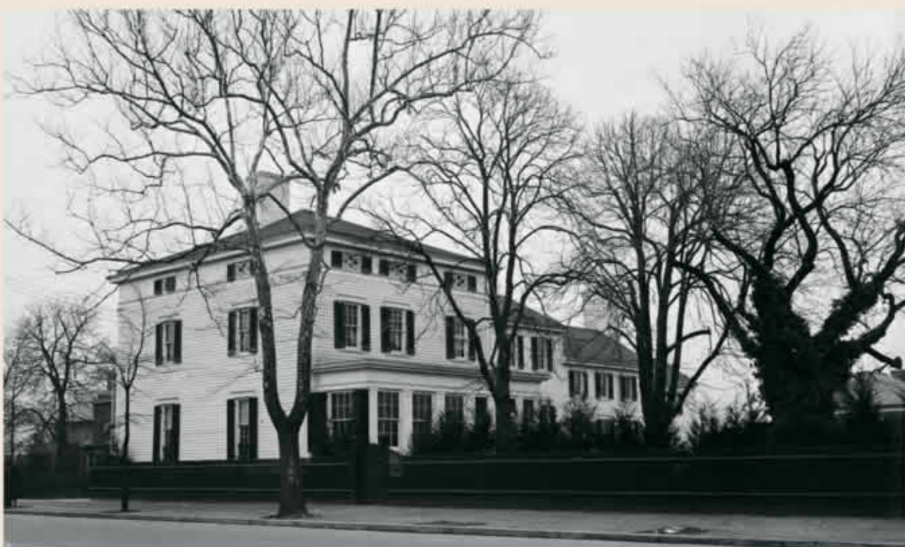
Lewis Home circa 1940