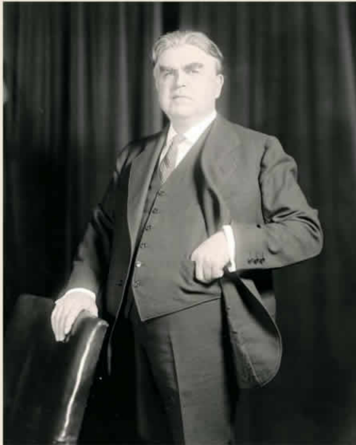
John L. Lewis