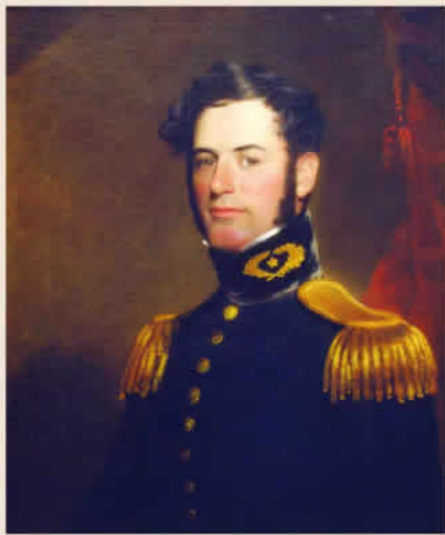
Henry "Light Horse Harry" Lee