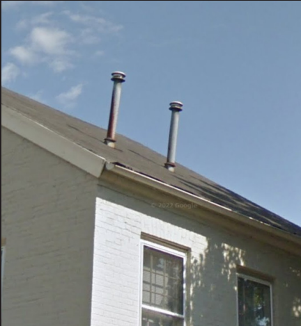
Example of an inappropriate exterior metal flue chimney on a historic building.