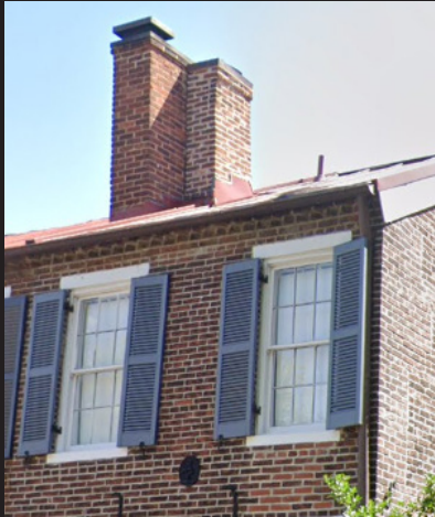
Example of brick chimneys commonly found on historic Old Town residences.