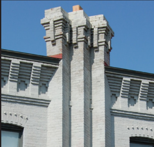
The corbelled brick chimney is a character defining feature of this Queen Anne style residence.