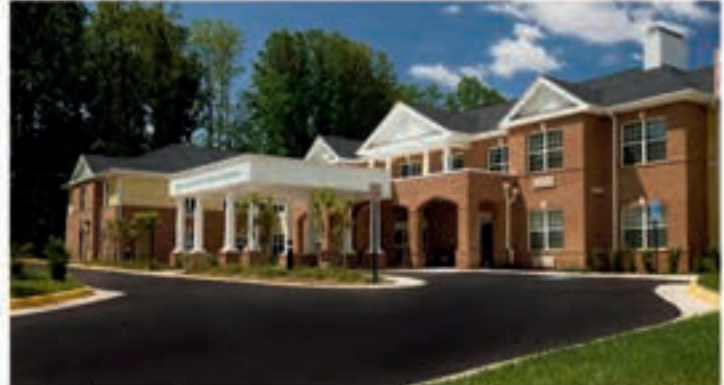
Mixed Income Affordable Assisted Living Facility