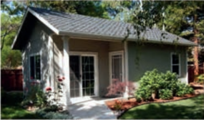
Accessible Dwelling Unit